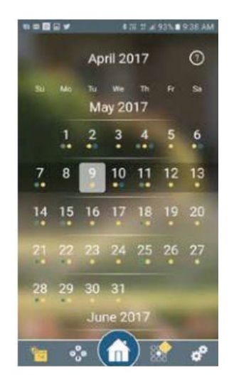
Calendar: Watering days for the next month