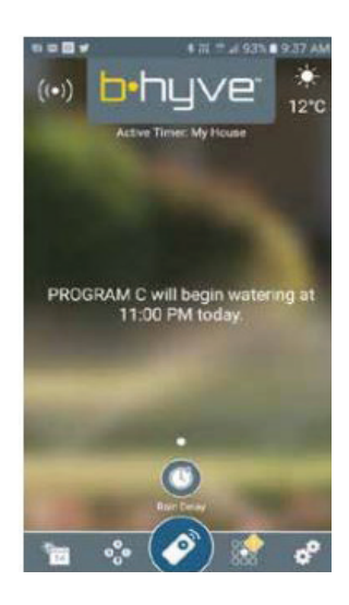
Home screen: Current temperature and next watering