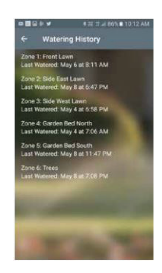
Watering history: Overview per day

Note: For use in cold water irrigation systems only, for all other applications please consult HR Products Images are a guide only and may not represent final product