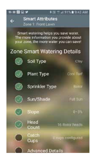
Smart watering: Set per zone to save water