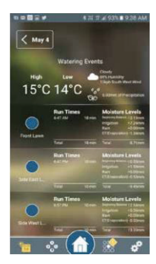
Result of irrigation showing: Starting moisture level, irrigation, rainfall, evaporation equalling net moisture in root zone